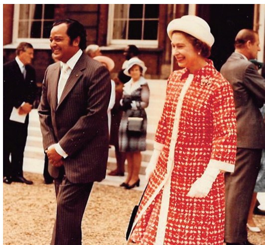
Sir Shridath Ramphal, appointed Commonwealth Secretary-General in 1975, escorts Queen Elizabeth to his first Commonwealth Day reception