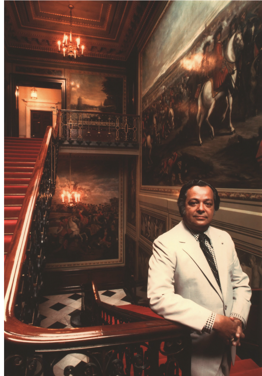
Sir Shridath 'Sonny' Ramphal 3 October 1928 – 30 August 2024