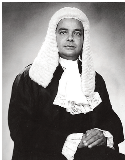
Shridath Ramphal QC on his appointment as Attorney-General of pre-independence British Guiana, 1965

A book of condolence, which was opened by the Commonwealth Secretariat shortly after Sir Shridath's death, will be available in Marlborough House for any further entries and will be closed later in the afternoon.