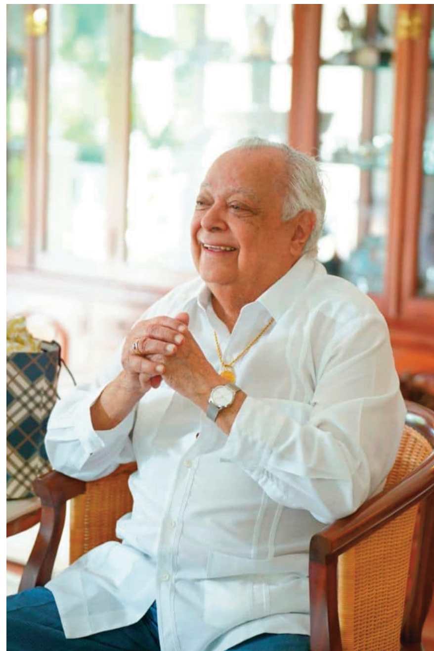
Sonny Ramphal relaxing at his home in Barbados

https://caricom.org/category/tributes-sir-shridath-ramphal/