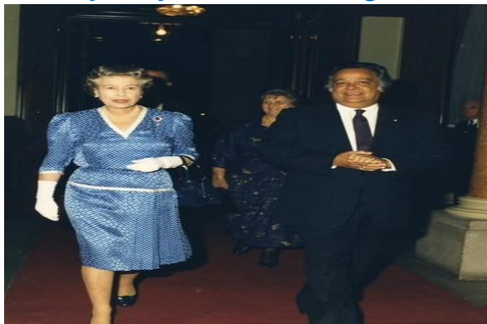
Sonny Ramphal with Queen Elizabeth II

Shridath 'Sonny' Ramphal, the second Commonwealth Secretary-General, died in August 2024 at his home in Barbados. On 1 July 2025, there will be an opportunity for former colleagues, Commonwealth supporters and friends of Sonny to join the UK commemorations of an