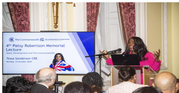
Tessa Sanderson DBE, delivering the 4th Patsy Robertson Memorial Lecture, 14 October 2024

Owing to this year's special commemorations, the 2025 AGM of the Association will be held online in June or July, on a date to be notified. Although often combined with the hosting of the annual lecture and reception, an online annual business meeting enables a wider pool of members to participate and a full discussion of matters of concern.