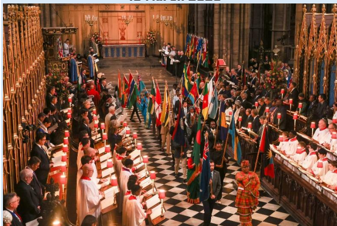
Commonwealth Day Service at Westminster Abbey

ExCo members attended the multi-faith Commonwealth Day Service at Westminster Abbey and Reception at Marlborough House. The 2025 Commonwealth Day theme was 'Together we thrive'.